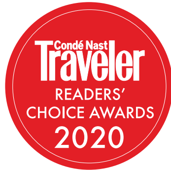
CONDE NAST TRAVELER'S AWARDS 2020 TOP 20 RESORTS IN THAILAND Aleenta Phuket Phang Nga Resort Spa