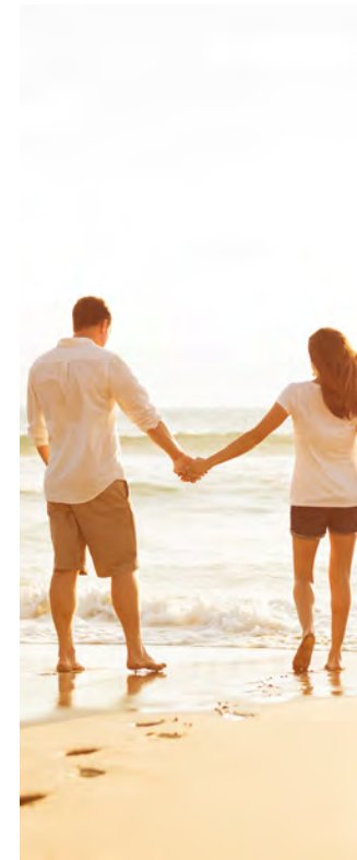
Social / Community / Relationship