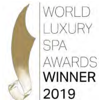
WORLD LUXURY SPA AWARDS 2019 COUNTRY WINNER FOR LUXURY SPA GROUP Ayurah Spa Wellness