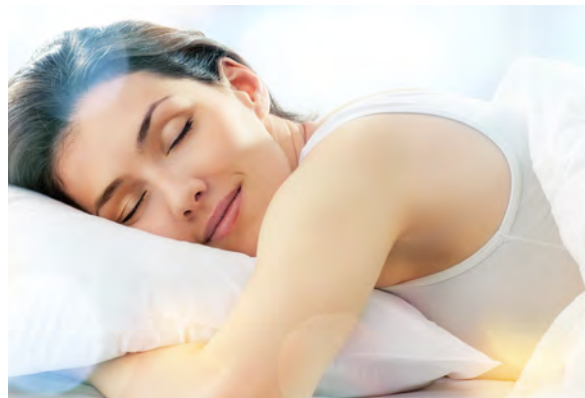
Sleep, Rest Recovery