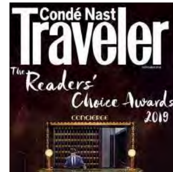
CONDE NAST TRAVELER READER'S CHOICE AWARDS 2019 #8 TOP 20 RESORTS IN THAILAND Aleenta Phuket Phang Nga Resort Spa