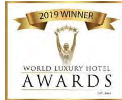
WORLD LUXURY HOTEL AWARDS 2019 SOUTHEAST ASIA WINNER LUXURY BOUTIQUE HOTEL akyra Manor Chiang Mai