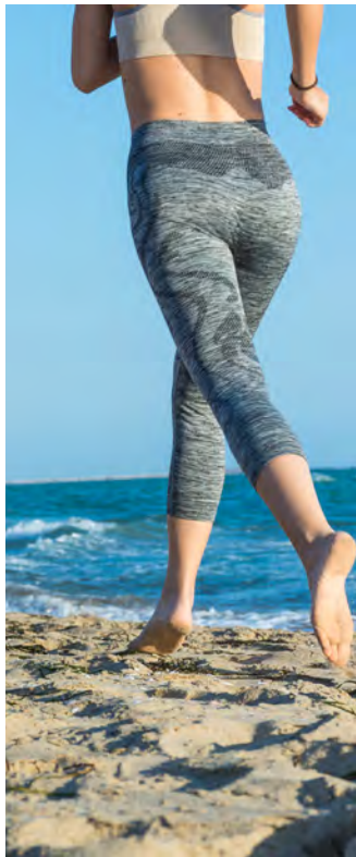
Movement / Exercise